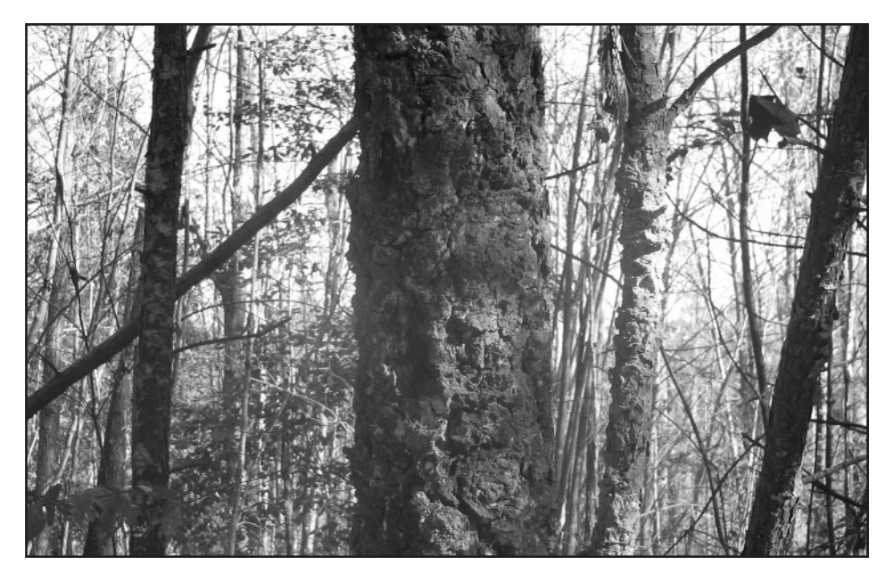
Sludge applied in forests can adhere to the bark of trees for a year, harming wildlife.

(www.unc.edu/courses/2005spring/epid/278/001/Shields_NS.pdf)