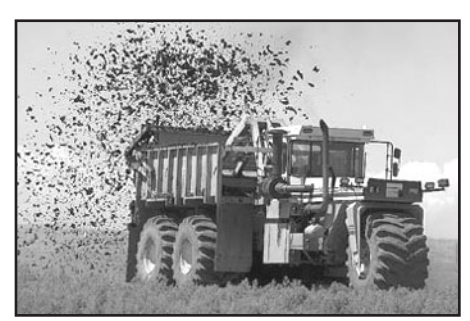
Terragator —Surface application increases health risks and run-off.

What exactly is this 'smelly mucky stuff' that is causing such havoc in many parts of rural America? Wastewater treatment plants remove contaminants from domestic and industrial sewage. Most of these removed contaminants concentrate in the resultant sludge. Today's sludge is not just "night soil " (human waste). Sludge generated in industrialized urban centers is a highly complex unpredictable mixture of toxic metals, pathogens, surfactants, carcinogens, solvents, and thousands of other manmade chemical compounds. With the exception of nine metals, most of the contaminants are untested, unmonitored, and unregulated. The 2002 NAS report confirmed that the current sludge regulations are not based on